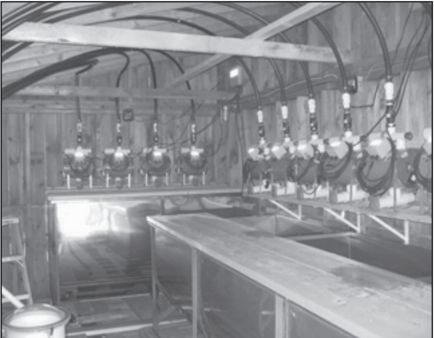
Figure 2. Inside of UVM PMRC “Red Series” sap shed. Each releaser is calibrated and equipped with a counter to measure total sap yield. All releasers and mainlines are connected to a common vacuum pump.