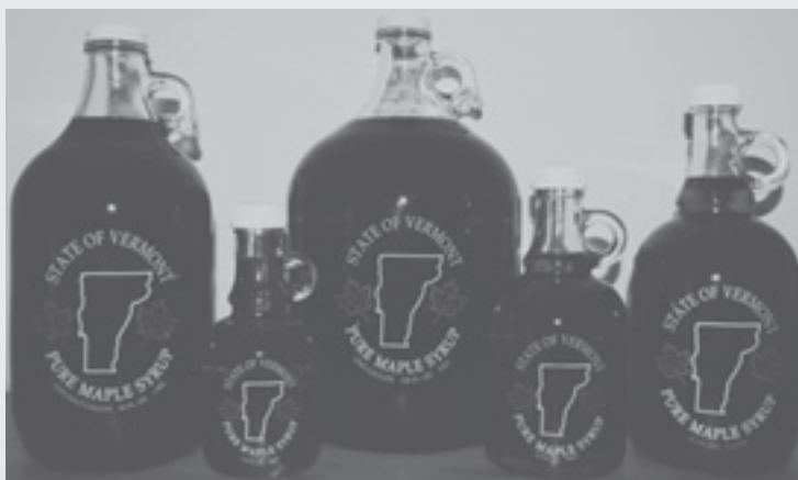
State of Vermont shown, other states are also available