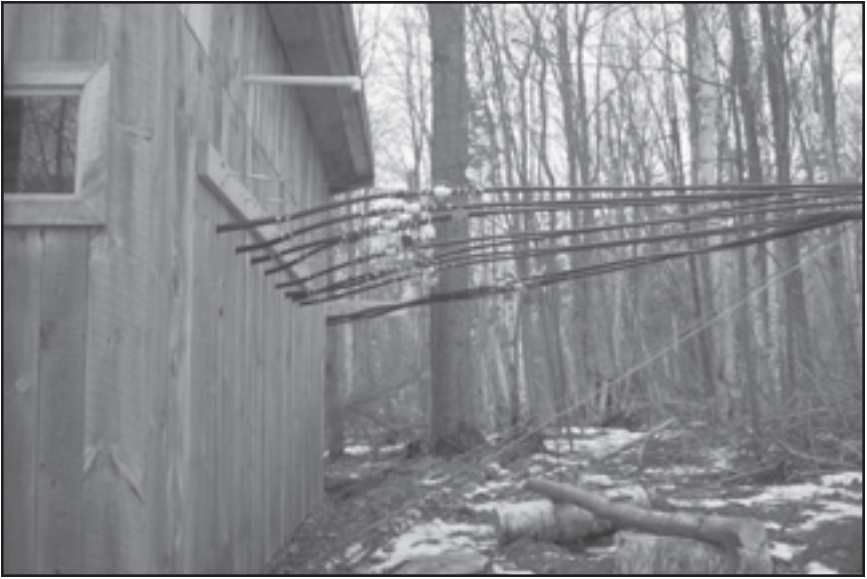
Figure 1. Experimental plot mainlines entering the UVM PMRC “Red Series” sap shed