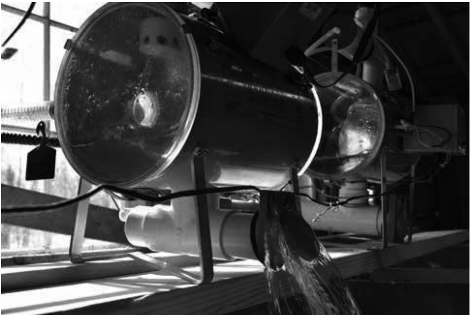
Figure 1. Two of the twelve mini-releasers used in this study. Each releaser was connected to 70-112 trees which made up a "treatment." Releasers were calibrated to a known volume of sap and are equipped with counters to allow calculation of the total amount of sap produced per tap each season for each treatment.