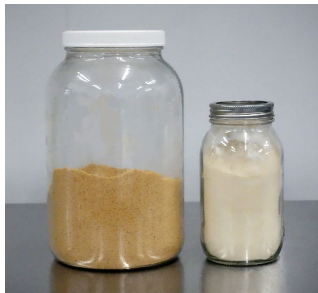
Granulated maple sugar before (left) and after (right) grinding to a powder using a melanger.

Large-scale production of powdered sugar can be hazardous due to the combustible nature of sugar dust. These instructions are only intended for production of small batches of powdered sugar. Promptly clean any surfaces that may become coated with sugar dust.