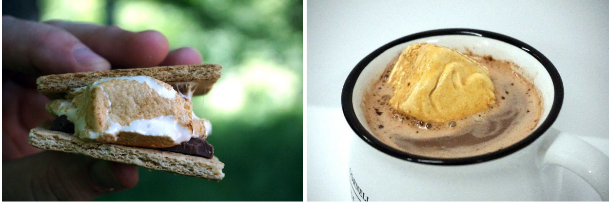
Maple marshmallows make decadent upgrades to s'mores and hot cocoa.