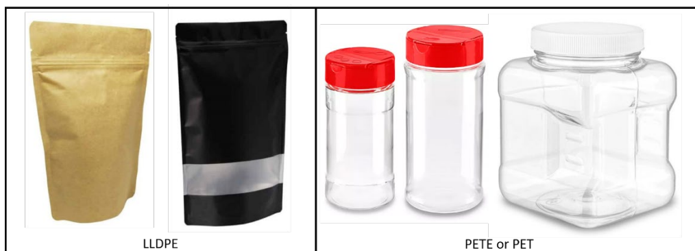
Figure 3. Packaging examples for fresh maple marshmallows.

Store marshmallows at room temperature in an air-tight container with a high moisture barrier. High moisture barrier packaging will prevent moisture migration and includes linear low-density polyethylene (LLDPE), polyethylene terephthalate (PETE or PET), and glass (Fig. 3).