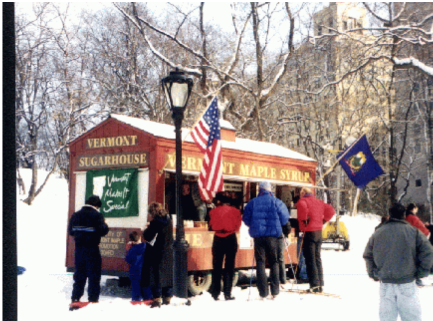
Vermont maple syrup in New York City, 2001

If you want to stay in business, make a profit and enjoy life, Keep Good Records and don't sell in the retail market at wholesale prices. Know the values of your products and price your syrup, candy or whatever else, at a fair retail market price. Have a good product and charge a fair price. It is your investment and the return comes to you.