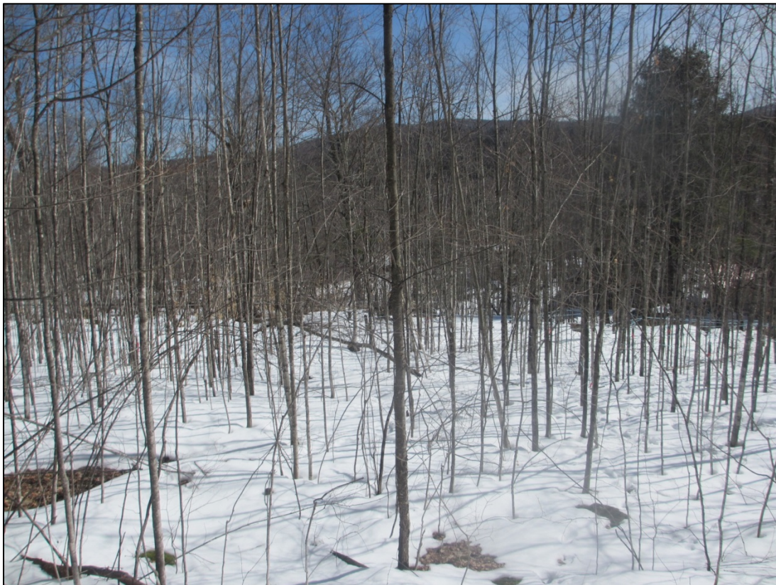
Figure 5. Regenerating stand near a maple operation in Vermont during the winter.

Stands that are regenerating after being cleared for pasture or harvest are often comprised of a large number of small-diameter maple trees (Figures 5 and 6). If the ultimate goal in these stands is to develop a mature sugarbush used for traditional maple production, thinning must be conducted in order to promote the growth and crown development of future crop trees. For example, in stands where the average tree diameter is 2" (in which densities can be as high as 5,000 or more trees per acre), it is recommended that an initial thinning be conducted to retain approximately 200 crop trees per acre. 1-3 It may be possible to combine the task of thinning with sap collection from small-diameter trees for a few years in order to obtain some production and income from syrup produced in the stand during the development of the stand into a mature sugarbush. This approach would help to offset some of the cost of thinning and other forest management in young stands being ultimately developed into a sugarbush.