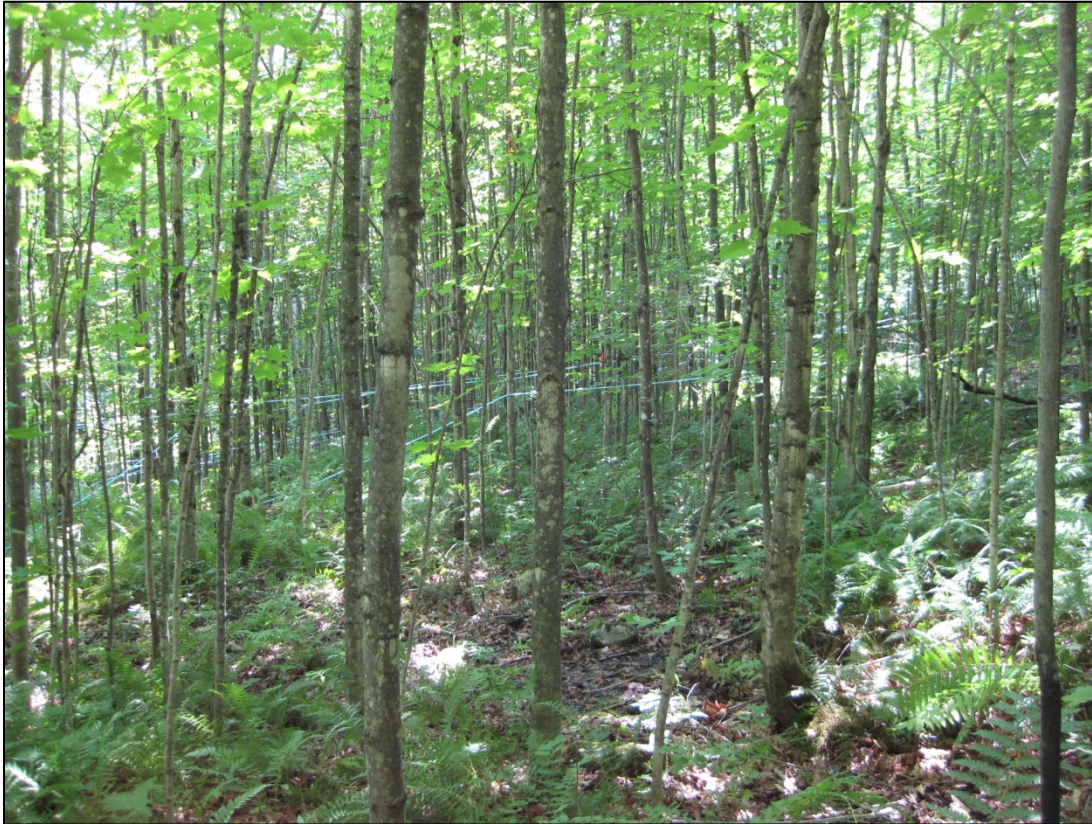
Figure 6. Regenerating stand from Figure 5 during the summer.

We have conducted some preliminary investigation of sap collection from trees in regenerating stands to determine the sap yields attainable from these trees and the level of resprouting achieved in these lower-light conditions. We collected sap and quantified syrup yields from 24 small-diameter trees (average dbh = 2.3") in a regenerating stand during the 2015 production season. The results of this study indicated sap yields from these trees were relatively low, between 0.02 and 0.06 gallons of syrup equivalent per stem, although this was from a single very short collection season (4/1 – 4/18/15). Despite the generally lower light conditions experienced by these saplings, regeneration of the cut stems the following growing season was quite good. Many saplings had vigorous regrowth, and only 1 of 24 trees failed to resprout (Figure 7). Thus, it appears likely that sap collection from small-diameter trees in regenerating stands could be combined with thinning to promote the development of crop trees, however the sap yields may be relatively low, and resprouting would ultimately be limited by the amount of available light. Whether the economics of implementing this practice would be favorable would largely depend on the specific circumstances of each individual situation, including the number of trees per acre available for sap collection, the availability of existing tubing systems in the area, and the costs of thinning.