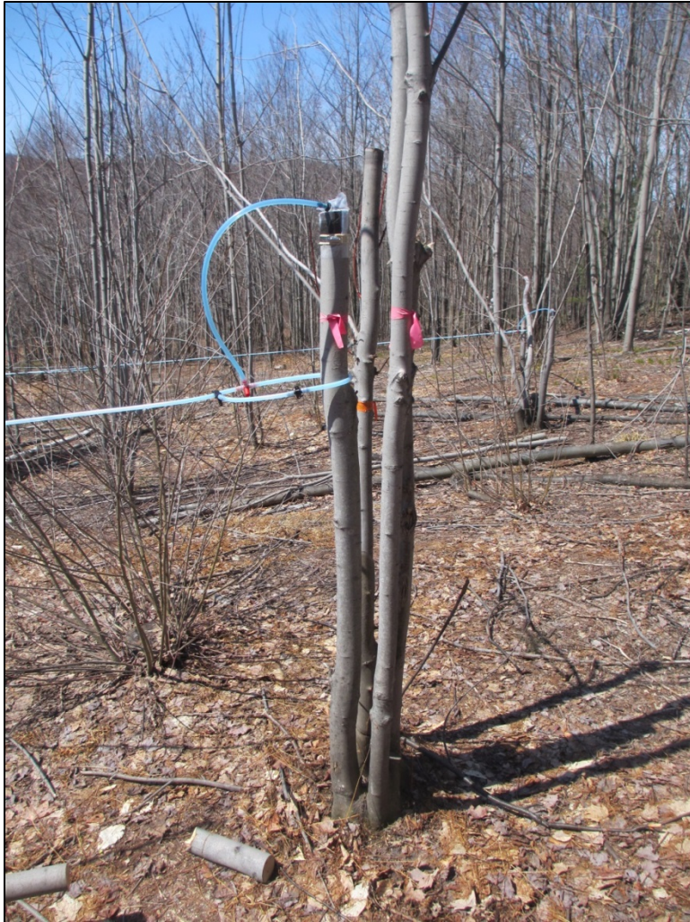
Figure 3. Multi-stemmed tree cut for a second year of sap collection. Note the prior year's cut stem with resprouted new growth to the right.

previously uncut stem until all intact stems are used; subsequent cuts are made as described for single-stem trees (Figure 3), but rotating among available stems.