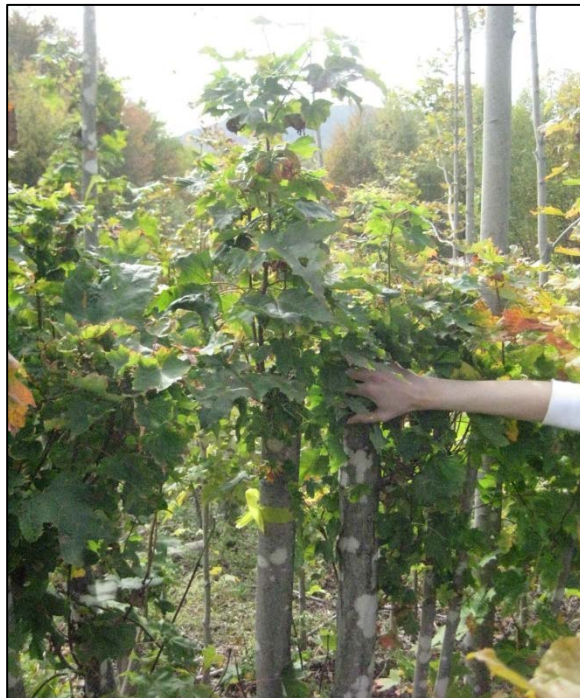
Figure 2. New growth emerging from dormant buds beneath the bark of cut stems ( left ), and regrowth from cut stems ( right ).

Trees can be re-cut for sap collection the subsequent season after re-sprouting. The new cut is made lower on the stem, generally between 6-12" below the top, at a location beyond the majority of the stained wood generated in response to the previous year's cut (note that sometimes the central portion of the stem is stained naturally). The fresh cut surface should be predominantly clear, white wood. Re-sprouting and new growth will generally occur again during the following growing season, and the process can be repeated with successive annual cuts made in a similar manner until useable stem is exhausted, or sap collection from the remaining stem becomes difficult due to logistical factors (low height, etc.). This type of sap collection can also be performed with multiple-stem trees, in which several stems originate from a single root system (Figure 3). In multi-stem trees, each annual cut is made on a new,