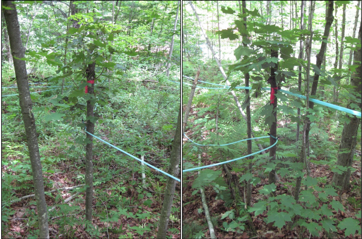
Figure 7. Resprouting and new growth from maple saplings cut for sap collection the previous spring in a regenerating maple stand.