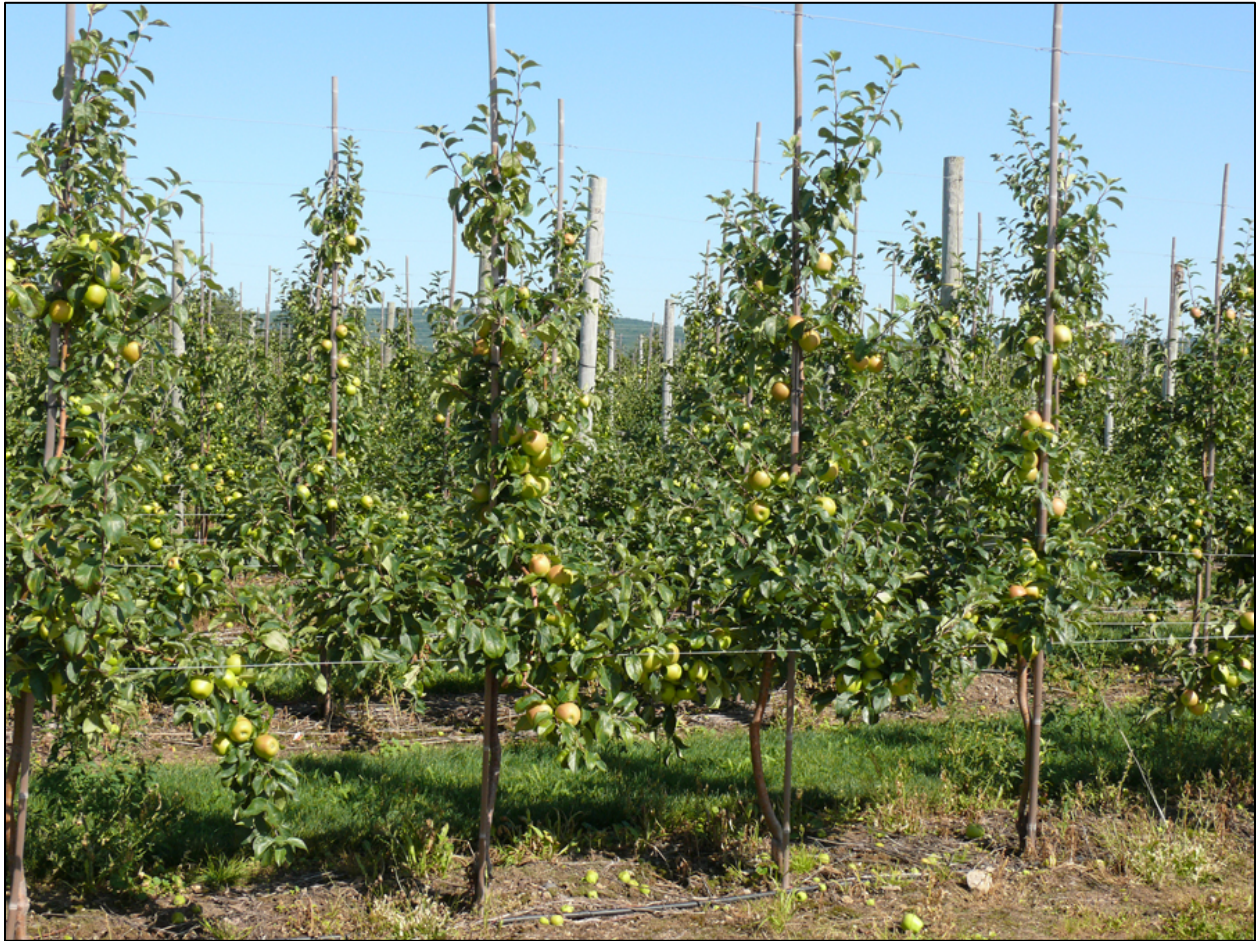
Figure 4. High density apple orchard in Ontario.

Perpetuation of sap collection from small-diameter trees over the long-term in a crop system can be accomplished using a variety of strategies. Because of greater sap yields and the relative ease of long-term annual sap collection, multi-stem trees are likely the optimum tree type to be used in this application. In this type of system, individual maple saplings are planted, and “coppice” cuts are subsequently made at the base of the stem in order to promote a multiple-stem growth form. Sap collection can begin when individual stems reach 2" in diameter, and annual sap collection can continue as described previously using intact stems first, and then using previously cut and re-sprouted stems, until useable stems are exhausted. At this point, coppice cuts could be used to initiate new, multi-stem growth from the existing root systems. If tree growth is too rapid, sap could be collected from more than one stem per season, although yields are likely to be impacted to some degree.