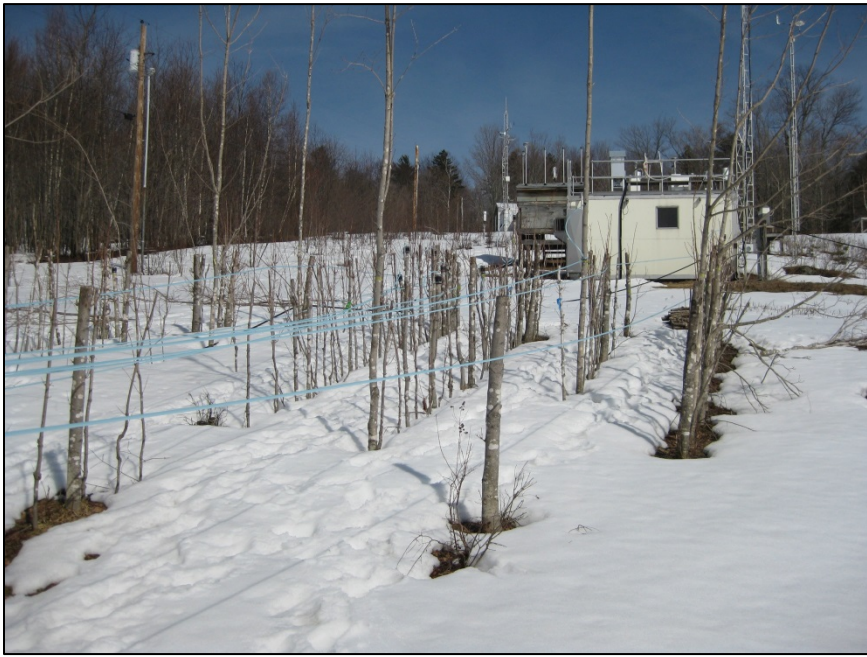
Figure 1. Sap collection from small-diameter trees. Trees before cutting ( upper left ), sap collection from cut trees ( lower left ), and regrowth from cut stems ( right ).