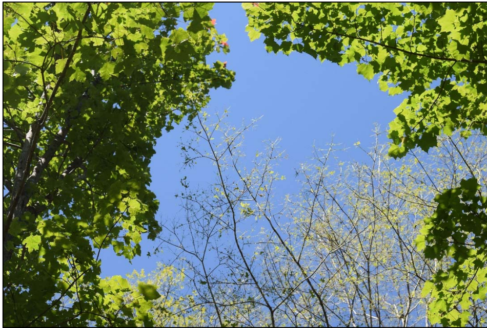
Figure 2. Healthy red maples adjacent to sugar maples defoliated by forest tent caterpillar ( Malacosoma disstria ). Red maples are not a preferred food source for this native pest, one example of how the presence of red maple can help increase the resilience of stands used for maple production.

However, despite its abundance, wide distribution, suitability for efficient maple syrup production, and potential for providing a means to increased production and income, some producers hesitate or decide not to include red maple as crop trees in their operations, even when they are present in the stands they currently tap. There are currently two primary beliefs that exist among maple producers which underlie this decision-making: