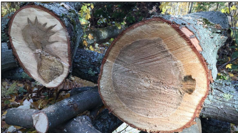
Figure 4. Example of a large central column of nonconductive, discolored wood (and resulting shallow sapwood depth) in red maple. Limited data suggests this phenotype is not predictable by bark characteristics (Wilmot 2016).

Further, red maples are known to be sensitive to injury, and often develop large areas of