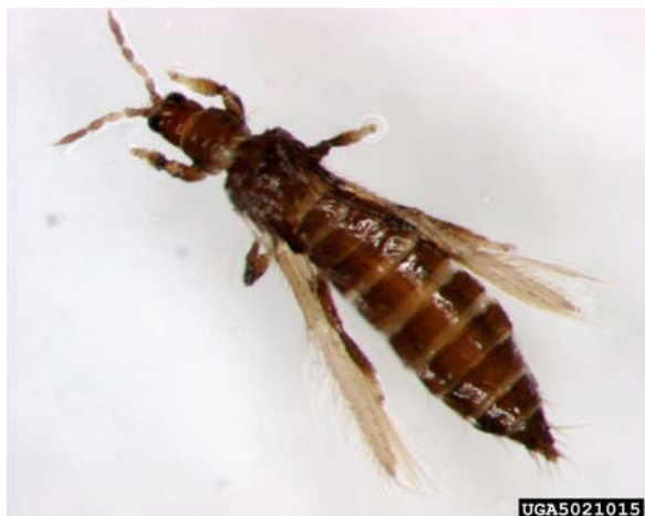
An adult pear thrips.