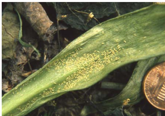
Pear thrips larvae clustered on a leaf on the ground, after being washed off the tree leaves by heavy rain, in late May, just prior to going underground to pupate.