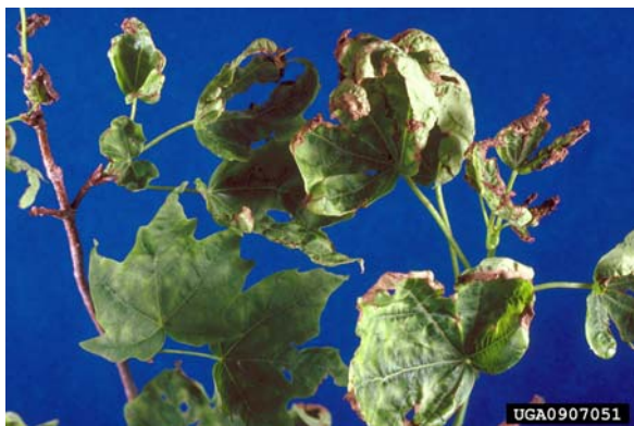
Maple leaf damage from Pear thrips

Taeniothrips inconsequens (Uzel); Family: Thripidae